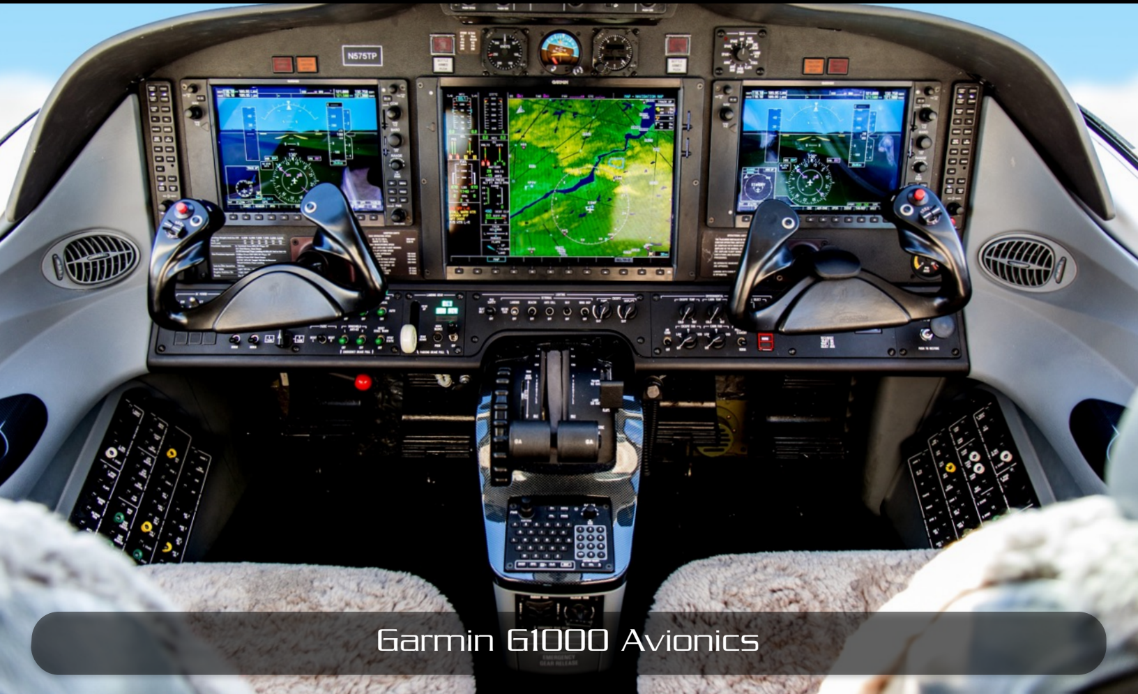
Garmin G1000 Avionics